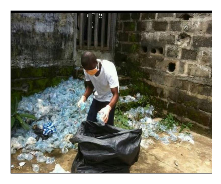
Figure 3 Collection of plastics

Portion of strong waste collected from actual collection of factors by using the use of the Monrovia city commercial enterprise. Subcontracted personal companies are answerable for choosing a muddle to pick out up clutter alongside the streets and in the end disposing on the landfill. 45.6 % of waste turned into transported using private organizations, 35 % explains the problem of open dumping in the town. 11. 4 % of waste turned into transported thru the Monrovia town agency (MCC) and 8 % using the Paynesville city business enterprise (Figure 4).