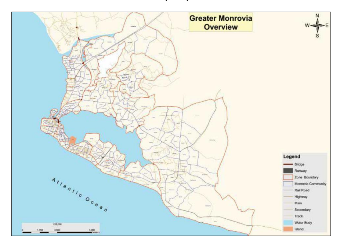
Figure 1 Map of Monrovia

Monrovia, the capital has a lifestyles expectancy of 51year [6]. Monrovia comprises as a minimum one in every four human beings in Liberia and gets almost half of as many once more for daylight sports activities. Monrovia consists of several semiautonomous townships (Congo Town, New Georgia, Sinkor, Paynesville Gardnersville, Dixville, Barnesville, Caldwell, Johnsonville, and Garworlon) and observed changed performed inside the city Monrovia (Figure 1). The sample population consisted of 500 households and discipline visits made to a number of places with waste management troubles, waste control sites, new community and personal area initiatives.